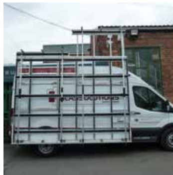
FITTED WITHOUT DRILLING THE VEHICLE SIDEWALL