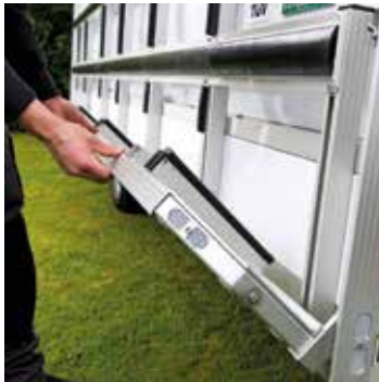
150MM TO 225MM FOLDING LEDGE CARRYING CAPACITY

Our Multi-Purpose Rack is already proving to be a big success within the glass, window and door industry, becoming a crucial tool to the day to day running of businesses. The exterior rack is constructed from lightweight purpose-made aluminium, and includes the following features: