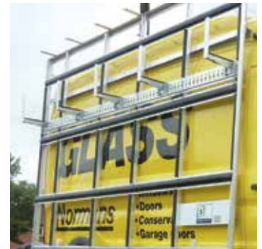
SECOND STAGE TRIM CARRIER