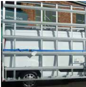
STRAP SECURING SYSTEM