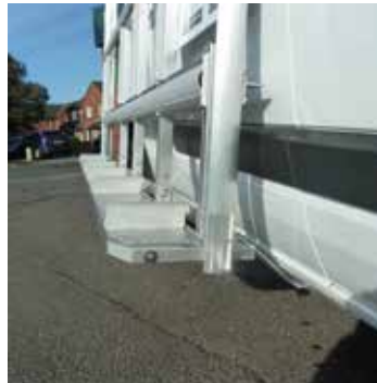
GREY RUBBER TO STOP MARKING